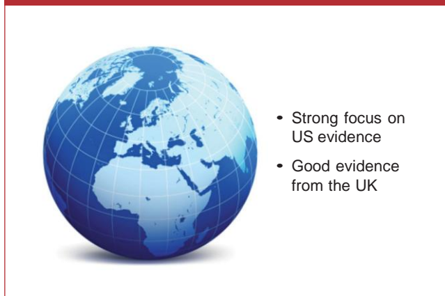
Figure 3: Geographical spread of the research

Although the review put in place no geographic boundaries, the vast majority of the literature found originates in the US. Six of the 51 studies come from the UK; the other countries represented are Canada, France, Israel, Japan, Singapore and Hong Kong (Figure 3).